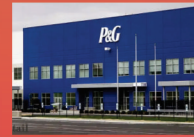
P & G