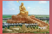
Statue of Equality