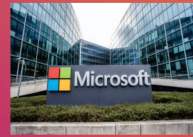
Microsoft Date Center